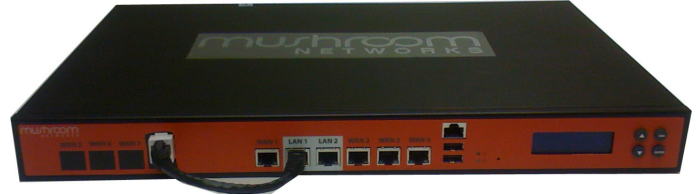
Bonding Proxy Appliance