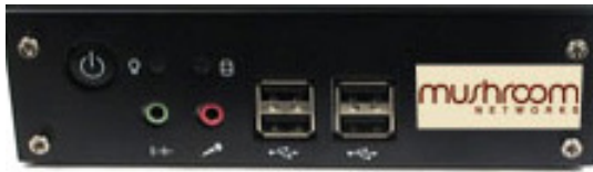
BBNA141 Rear Panel